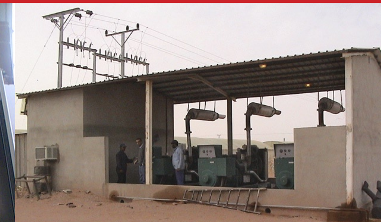
Saudi Marble with 8DG CAT 3508 SR-4 AVR and 2301A Speed Governors