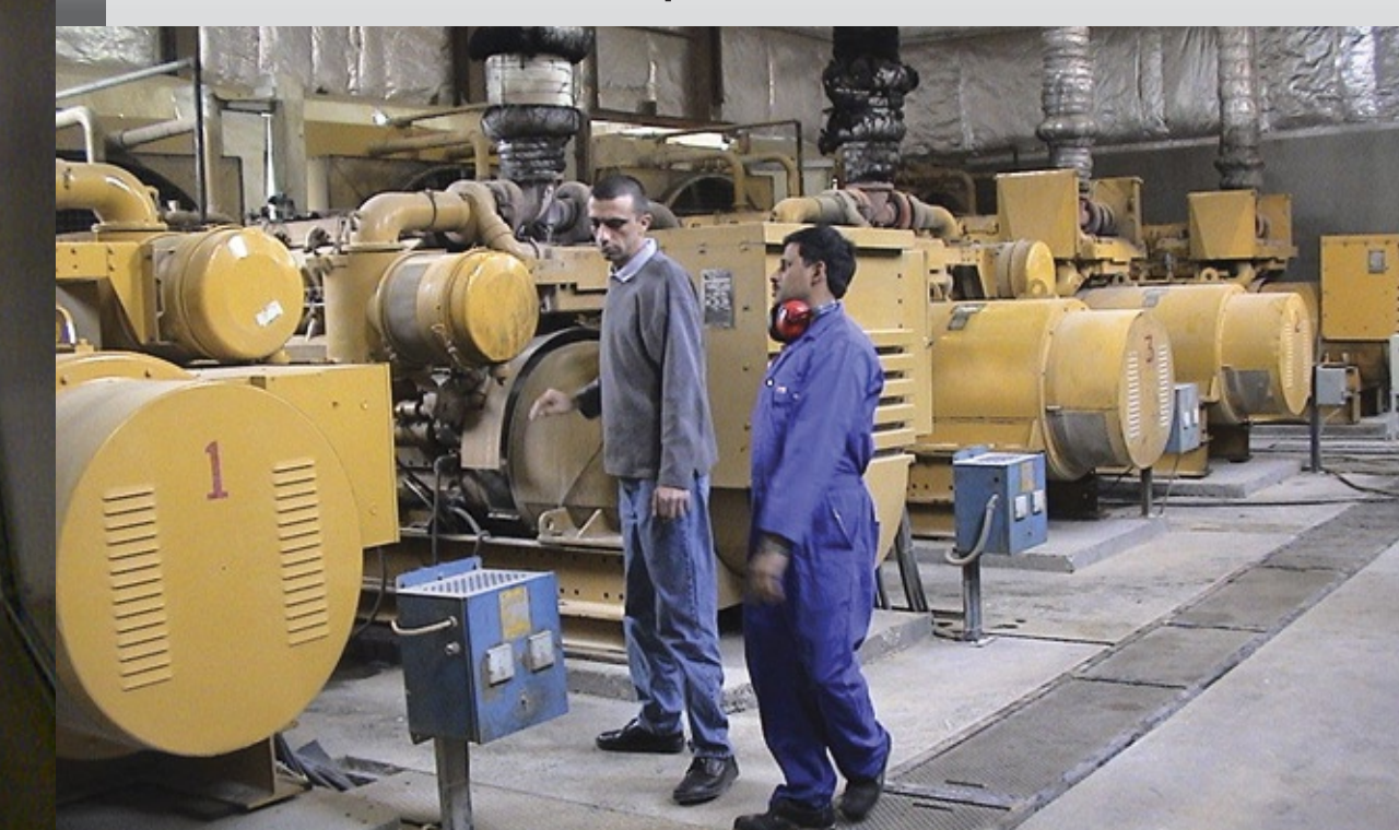
Farm Al Salim with 3DG Volvo EDC-III – Riyadh