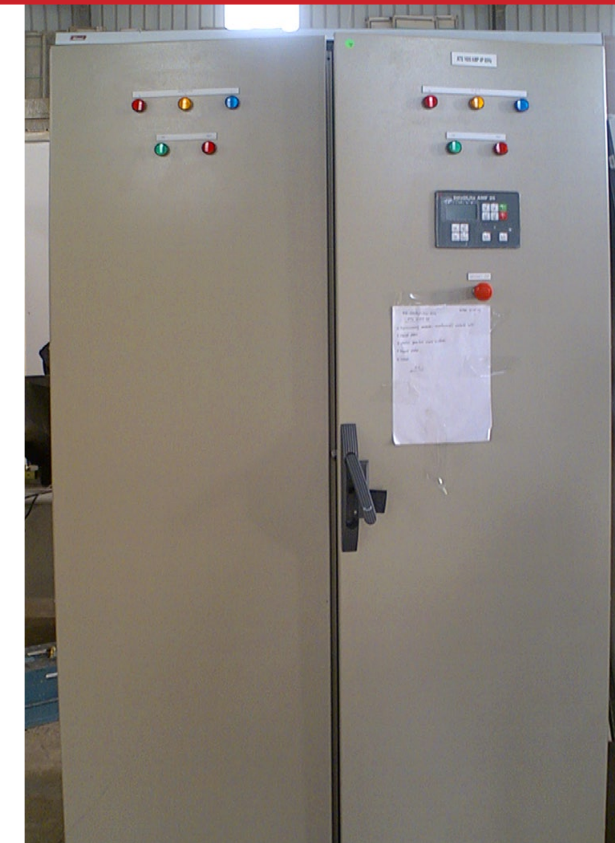
ATS 630A 3P Abu Nayyan Company Riyadh